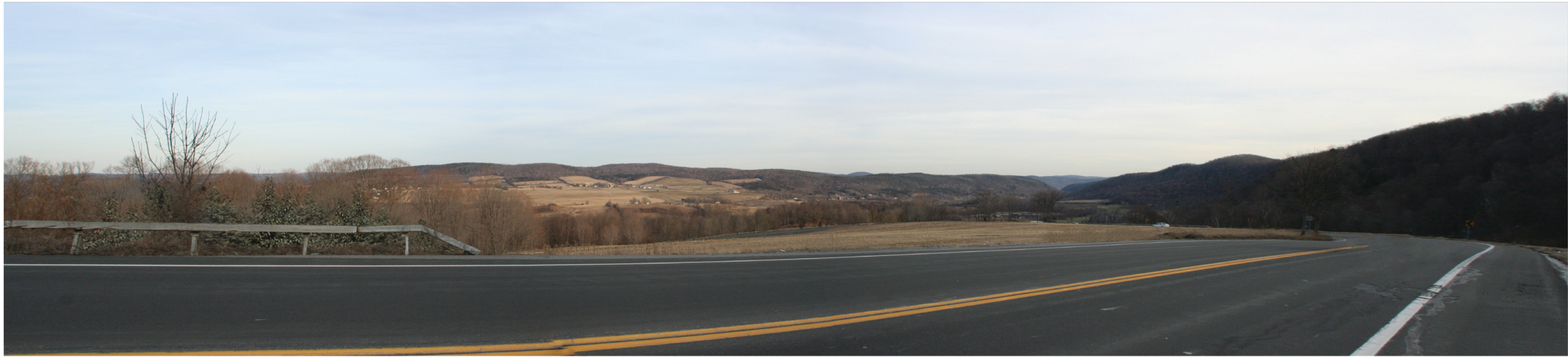
PERSPECTIVE LOOKING EAST