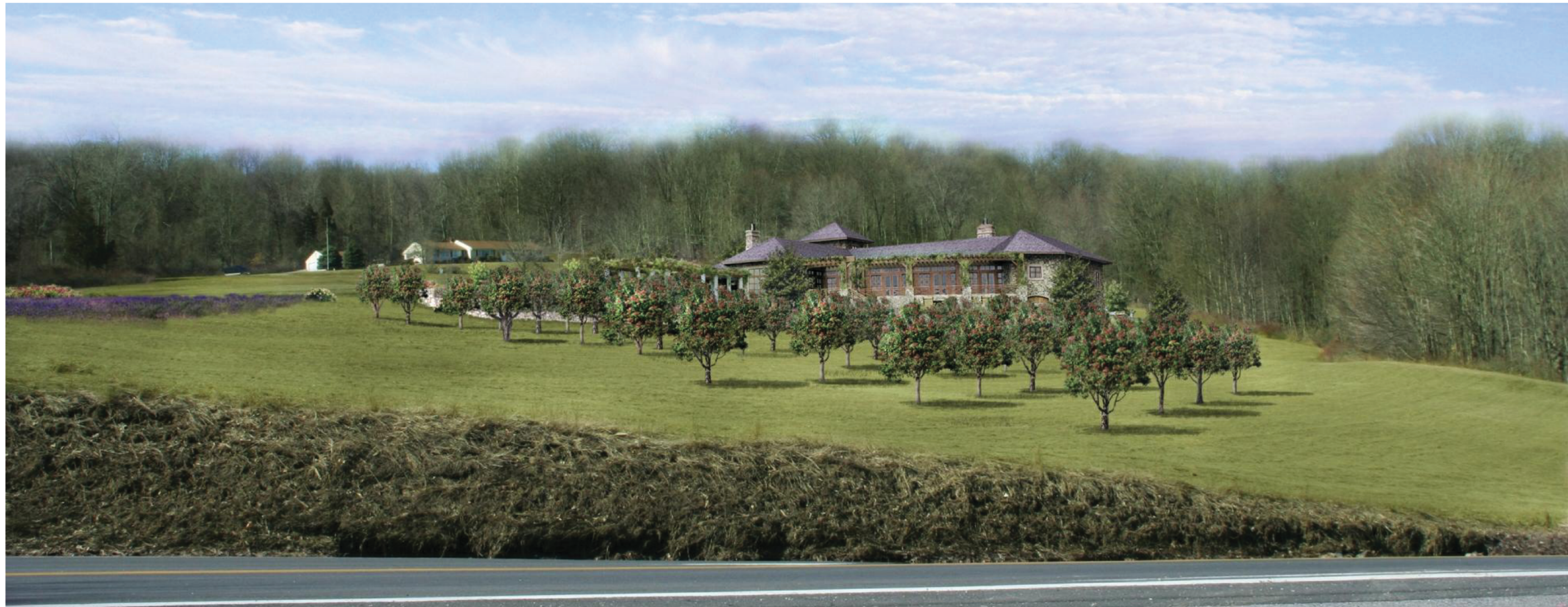
PERSPECTIVE LOOKING NORTH